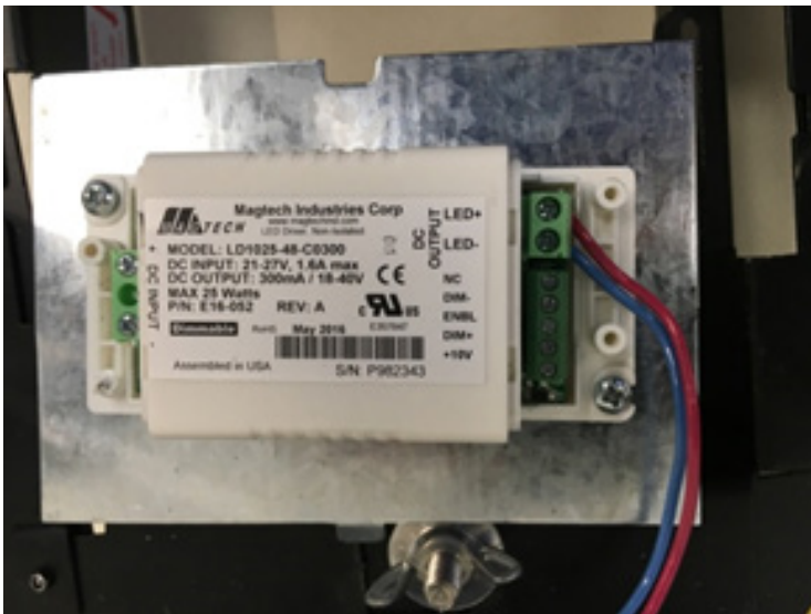
Figure D: Covers are removed from the LED driver to expose the power connections