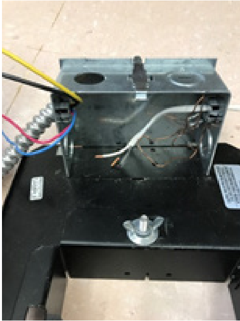
Figure F: Showing load cable in the junction box